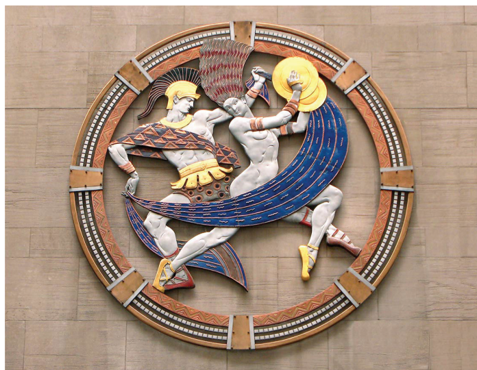
Image: Dance, Drama, Song , 1932. Relief sculpture on 50th Street facade, Radio City Music Hall.

Art History, English, History, Studio Art, Theater